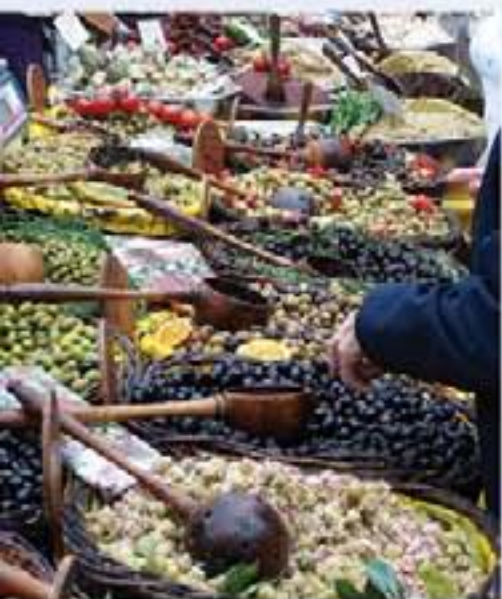
Olives, olives and more olives. Choose your favorite varieties when we visit the local outdoor markets.

Add an additional $700 for a single room. Prices do not include airfare.