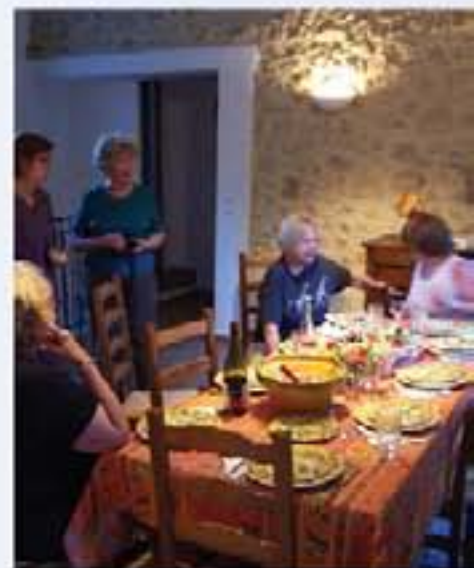
Each house on the estate is spacious and beautifully furnished, including modern kitchens and baths.