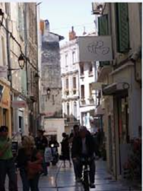
A side street in Avignon, our closest city. History, shopping and fine dining.