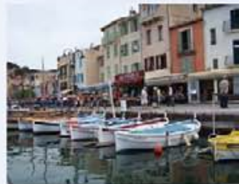
Cassis is a magical Mediterranean town with a colorful harbor and an abundance of shops and cafes.