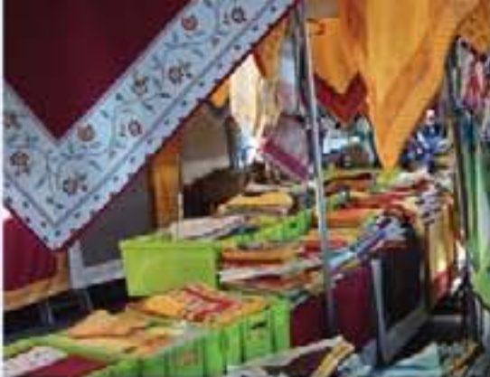
Colorful Linens and Provençal Tablecloths abound at the local Marchés.