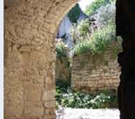
just another gorgeous archway