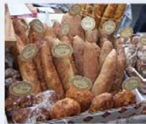
The French take great pride in their exceptionally fresh bread and we took full advantage at every meal!