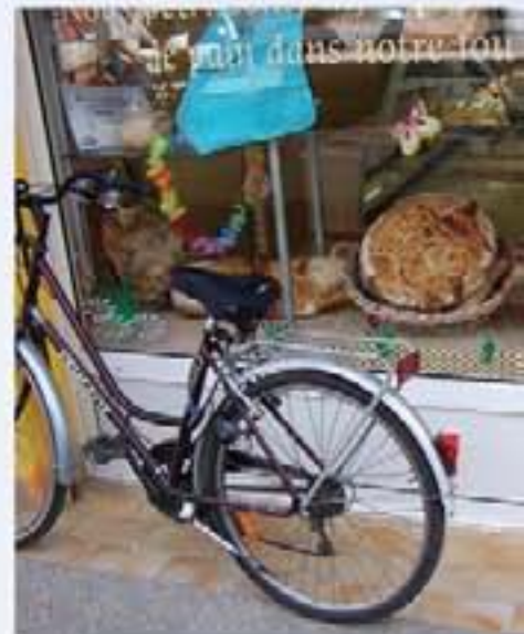
One of the FIVE bakery shops in Noves. All bake fresh twice a day. YUMMM!!